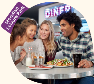
Meridian Leisure Park

42 MERIDIAN LEISURE PARK – perfect for a day out with family and friends, take in the latest blockbuster at the cinema, play a game of bowling or treat the kids to soft play. Grab a bite to eat with options from Bella Italia, Five Guys, Chiquito, Harvester and more!