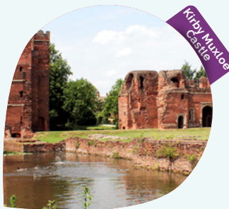
Kirby Muxloe Castle

41 KIRBY MUXLOE CASTLE – a story of intrigue, betrayal and murder lies behind this 15th century castle. Step back in time to the Wars of the Roses as you take in the historic and impressive remains.