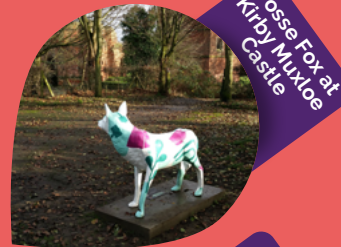
Fosse Fox at Kirby Muxloe Castle