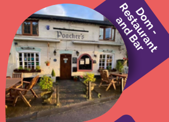
Dom - Restaurant and Bar