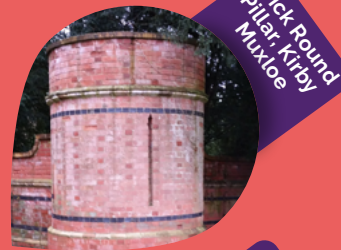
Brick Round Pillar, Kirby Muxloe