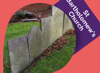
St Bartholomew's Church

houses on the left. Just past the bend take the footpath on the left and cross the fields. Follow the footpath markers across the fields until you pass a farm on your right. Continue on the marked path until it exits onto Beggars Lane. Cross the road and turn left.