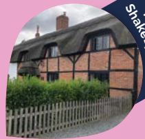
Former Pub The Shakespeare