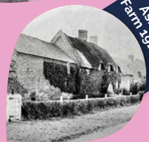
Ashleigh Farm 1920-30