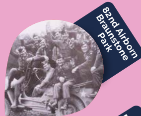
82nd Airborne Braunstone Park